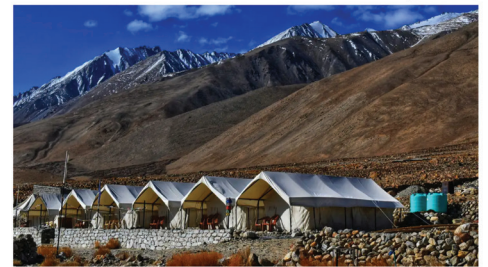
The hospitality sector in Ladakh has stepped forward to support tourists left stranded following the temporary closure of Leh Airport and the suspension of all road traffic due to the massive snow-cum-ice. The 83 hotels listed on the Leh Airport Closure List.

Share: X WhatsApp Telegram Print Add as preferred source on Google