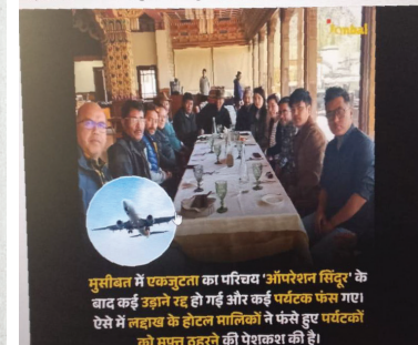
मुरीबत में एकजुटता का परिचय 'ऑपरेशन सिंदूर' के बाद कई एरनें वरु हो गईं और कई पर्यटक कंसंग गए। पर्वत में लड़ाकू के होटल मालिकों ने फसे हुए पर्यटकों को मुक्त करने की पेशकश की है।